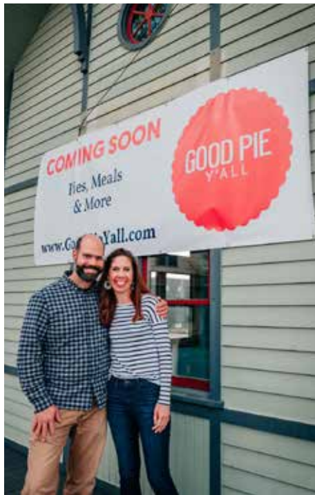
Good Pie Y'all • 3327 Creek Rd

These businesses recognize the extraordinary opportunities and development ahead on the Loop. The Downtown Loop Streetscape Master Plan was approved by Council last summer. Next steps include selecting a consultant to hold public engagement sessions with stakeholders and property and business owners to get their input into the final design of Depot Square and Creek Road improvements.